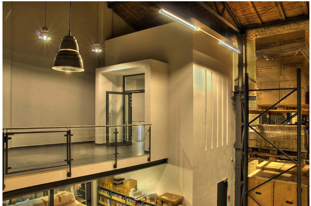
Part of the Kanonenhalle is used for storing articles that are ready for dispatch. Eye contact is possible between the offices and storage spaces. Everywhere, it is possible to see with just how much love for detail within a holistic approach was invested in renovating the building and fitting out its interior for its current purposes.