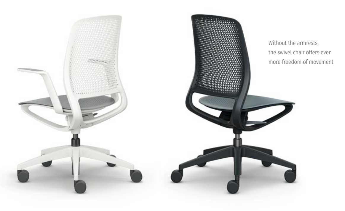
Model in pale grey

The flowing form of the seat rocker, which combines the backrest and seat area, makes se:motion a truly agile companion