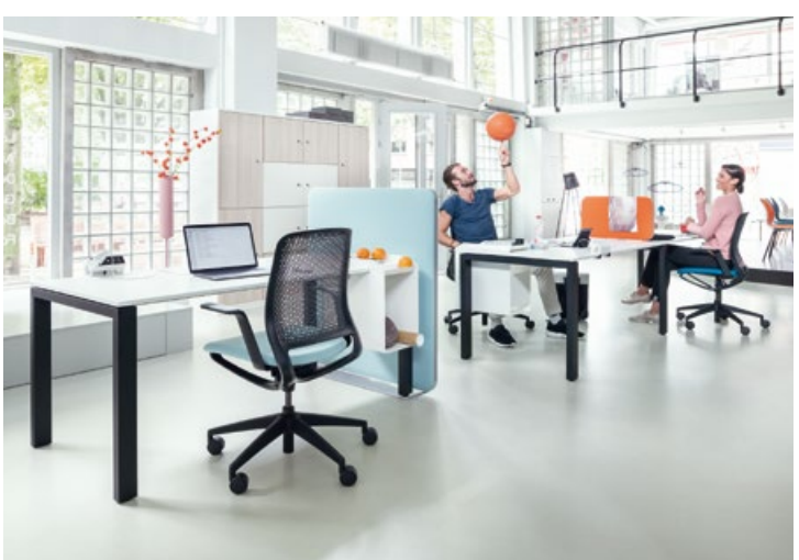
From focused individual work to team work