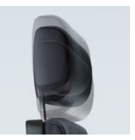
Comfortable neck support With leather cover and pleasantly soft upholstery, chrome-plated support, height-adjustable by 50 mm

Lumbar adjustment Perfect controls allow quick adjustment of the height and depth of the robust "Schukra" lumbar support to individual body size and weight