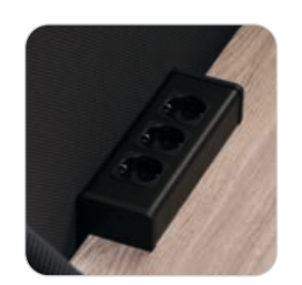
Communicative. On request, secretair can be supplied with an attachable multi-socket for notebooks, tablets etc.