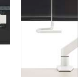
The single arm with crossbar can accommodate two monitors with a size of up to 27 inches The handle is used for easy and smooth adjustment.