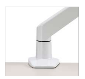
The elegant and reduced design of the adapter and monitor arm blends in with any workplace.