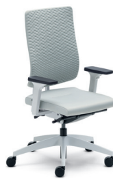
black dot air