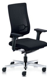
black dot net